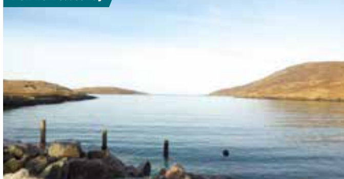
View from Causeway

It is well worth a visit (the castle is open in summer, courtesy of Historic Scotland) to see the tide cleaned toilets and marvel at its seeming impregnability. It even has its own fresh water springs and fish traps.