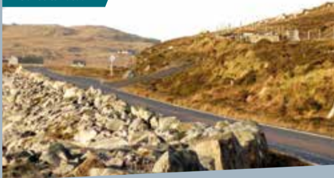
Entrance to Easdail